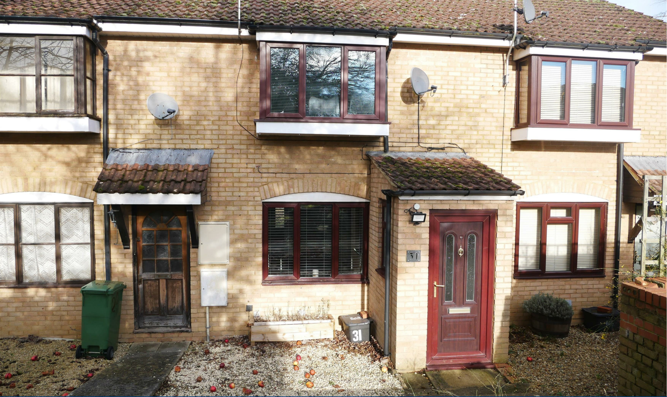
Highgrove Close, Calne £220,000